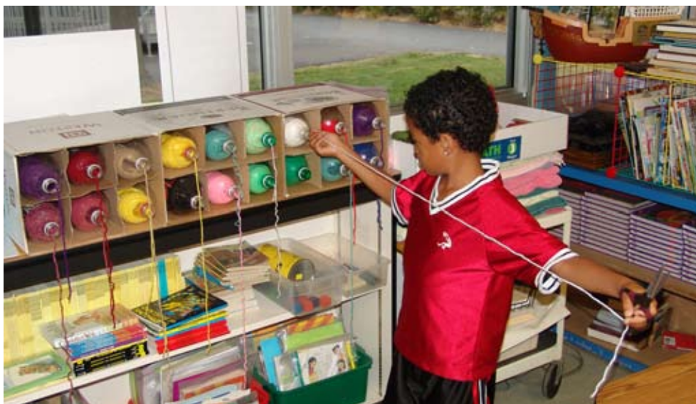
Fig. 9-13 If you tie a pair of scissors near the boxes, you'll make it easier for your students to cut a new piece of yarn.