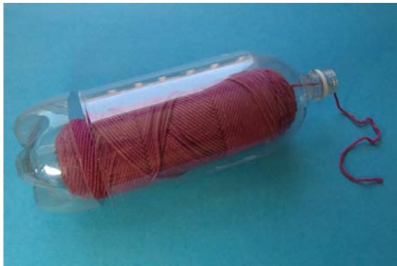
Fig. 9-12 A two-liter soda bottle is all you need to make a handy yarn dispenser.